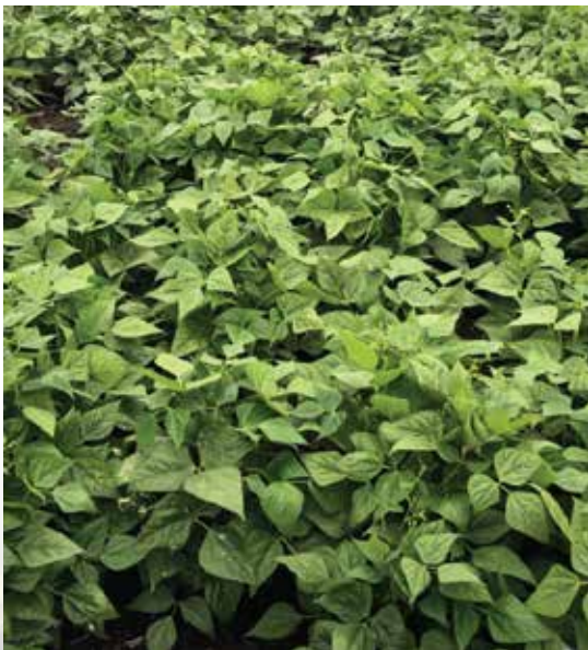
Robust emergence is observed in bean crops with SeedStart Root 2 applied.

Loaded with 4X MORE ZINC than EDTA products