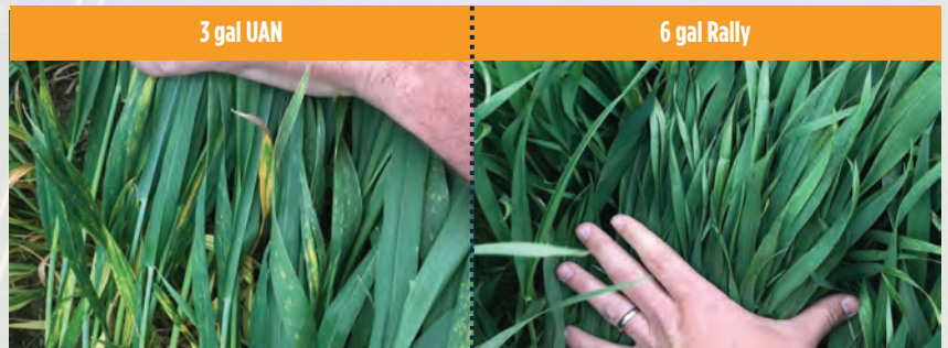
The liquid urea based formulation of Rally consistently achieves a higher uptake of nitrogen to the plant as compared to UAN applications.

8-10% increase in nitrogen utilization using foliar-applied Rally vs. UAN