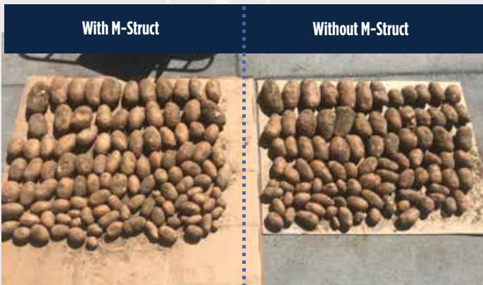
M-Struct: 114 potatoes, 55 lbs

Data collected comparing treatments with varying M-Struct and phosphorus rates as compared to Regional Standards; applied in furrow and deep banded.