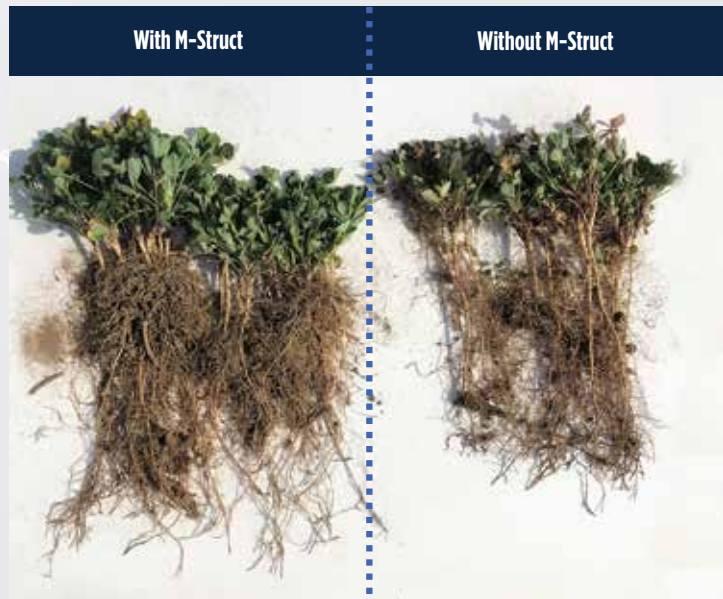
1 gal M-Struct + liquid fertilizer mix fall-applied on Alfalfa